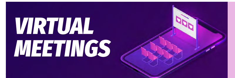
Illustration Credits: Designed by Sarah Brubaker and Freepik and Vecteezy.

Check out our online Zoom meetings! There are plenty of different groups and meetings still going as we make our way back together. For a full list of events with links, visit our online calendar at www.asburyfirst.org/events.