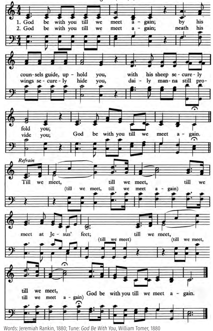
#672 "God Be with You till We Meet Again" (vv. 1, 2)