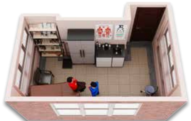
Artist representation of new exam rooms