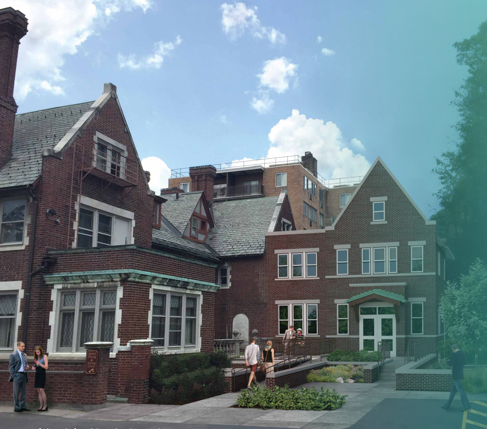
Artist's rendering of the updated Outreach Center